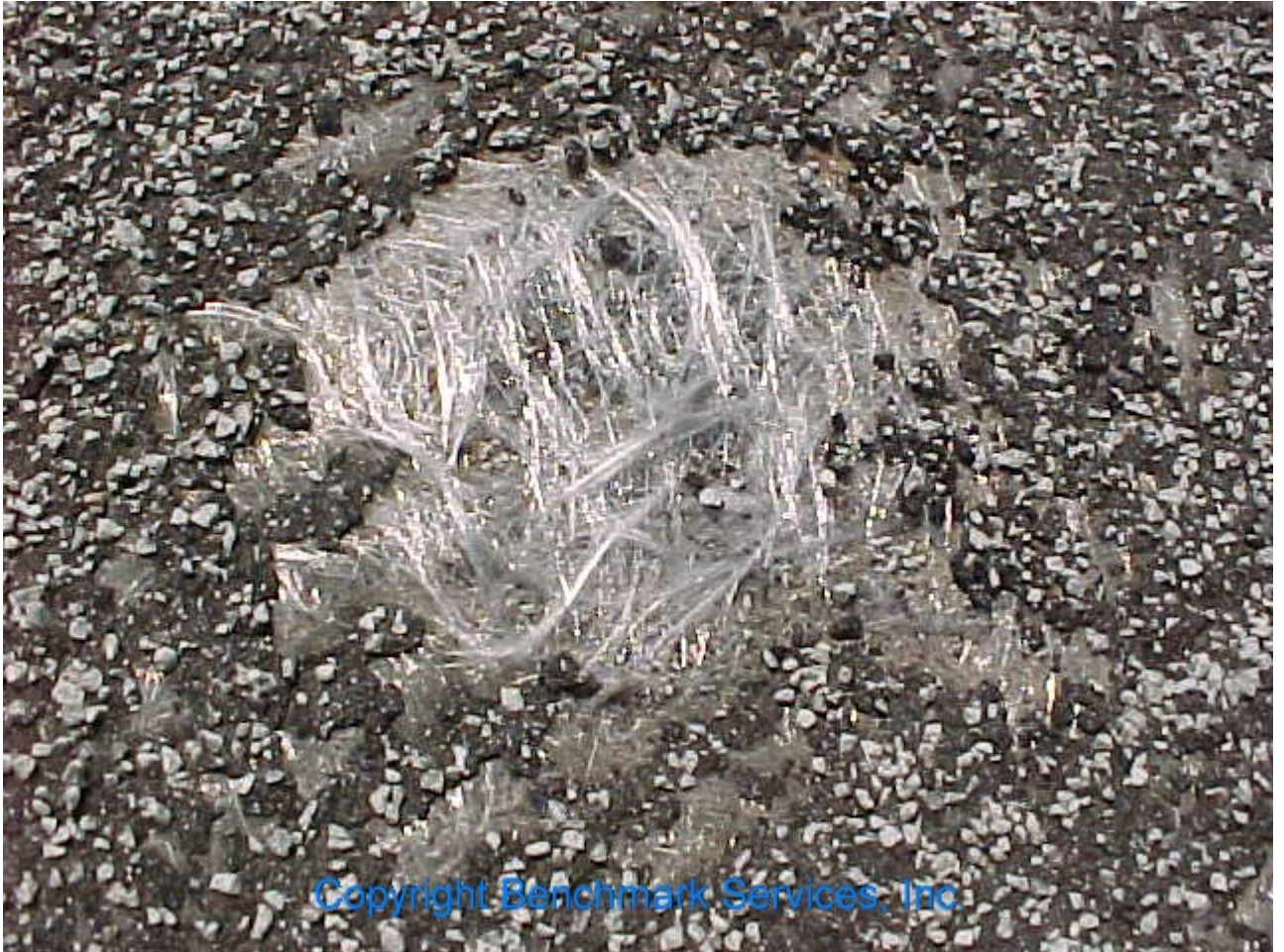
Figure 5 - SBS Modified Bitumen Roof Granule Displacement Caused By Hail