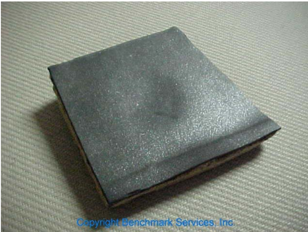
Figure 11 - EPDM Fully Adhered To Fiberboard Insulation, No Membrane Damage