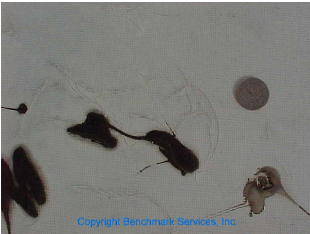
Figure 8 - Hail Damaged Reinforced PVC Membrane, Temporary Caulk Repairs