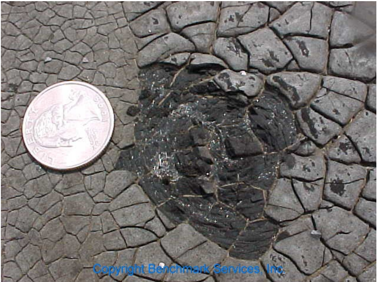
Figure 2 - Built -up roof damaged by 1 1/2" hail

Smooth surfaced or gravel, the result is the same. The asphalt or pitch is displaced or cracked at the surface and the fiberglass felt may be fractured allowing water infiltration and the beginnings of premature deterioration. Water infiltration into the insulation may spread and what begins as a small puncture may become a large repair. Multiple hail blemishes may require tear-off and re-roof as the only practical remedy. The photo in figure 2 below shows a hail impact fracture on a smooth surfaced asphalt built up roof.