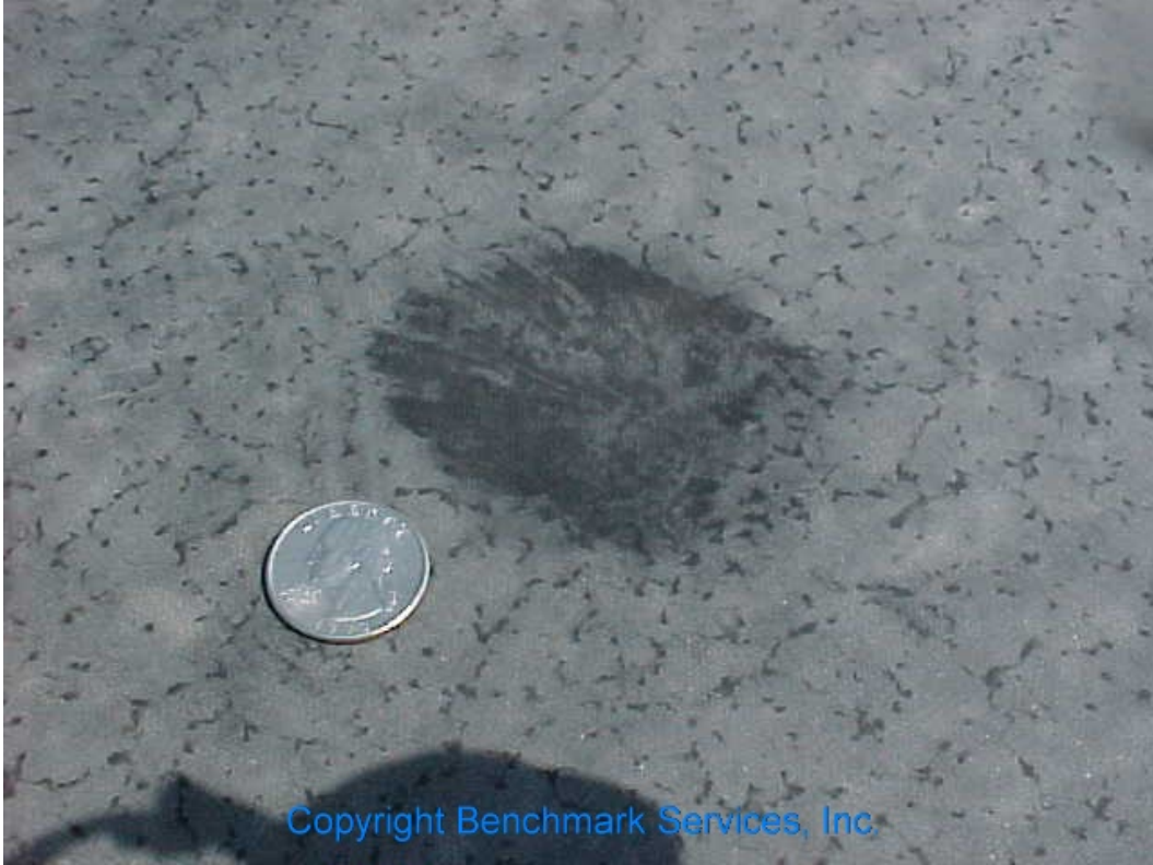
Figure 10 - EPDM Membrane Impacted by 2 1/2" Hail, No Membrane Damage