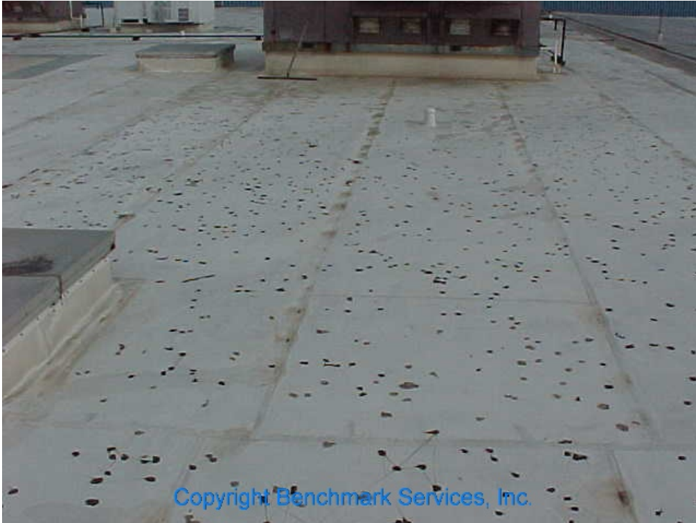
Figure 9 – Hail Damaged PVC Membrane With Thousands Of Temporary Caulk Repairs