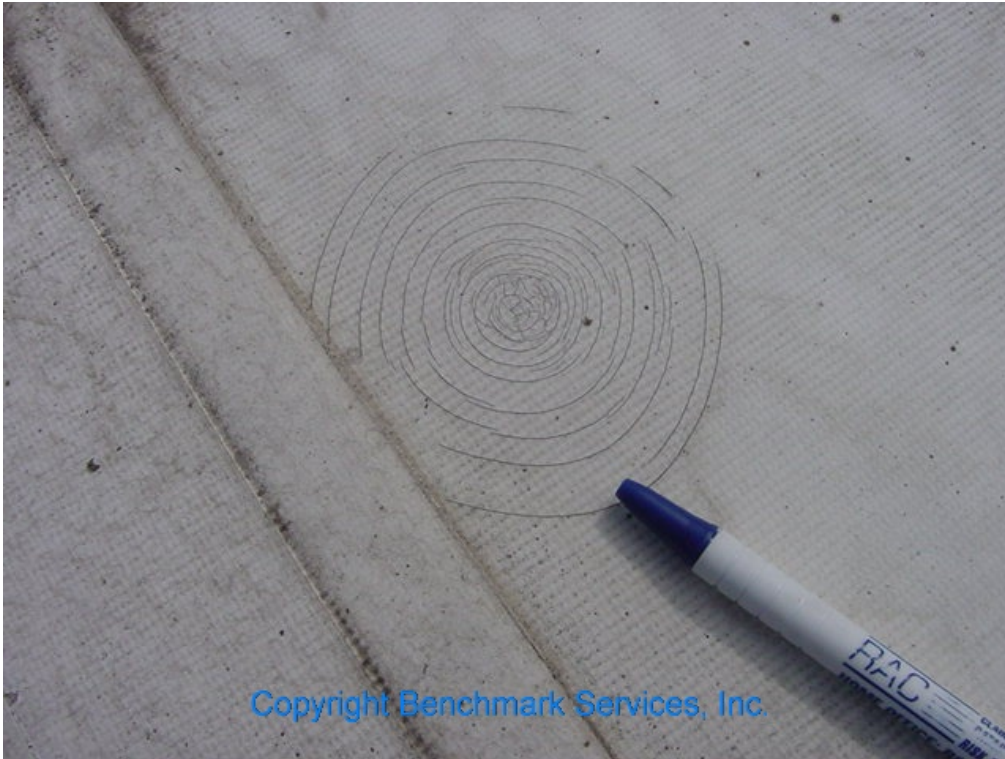
Figure 6 - Reinforced PVC Membrane Hail Fractured

The last two photos in this series are figures 8 and 9. They show a PVC roof approximately three years after a hailstorm. Repeated repairs were done with various types of surface caulking until the owner finally realized that it would not be possible to seal all of the hail fractures that continued to open up and leak.