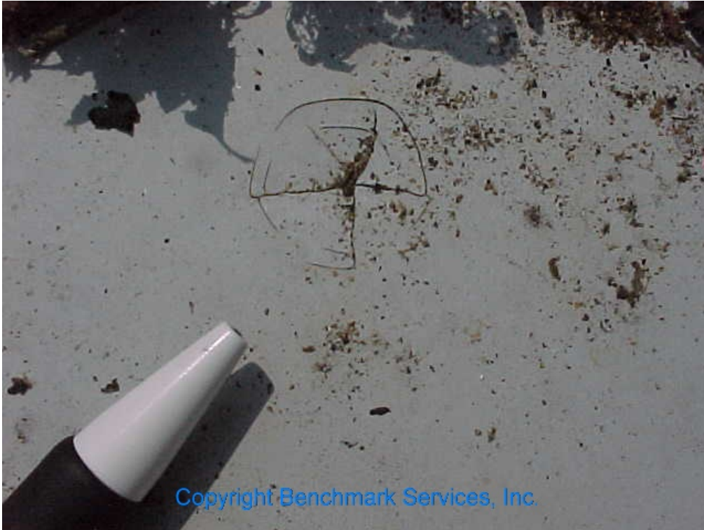
Figure 7 - Non-Reinforced PVC Membrane Damaged By Small Hail