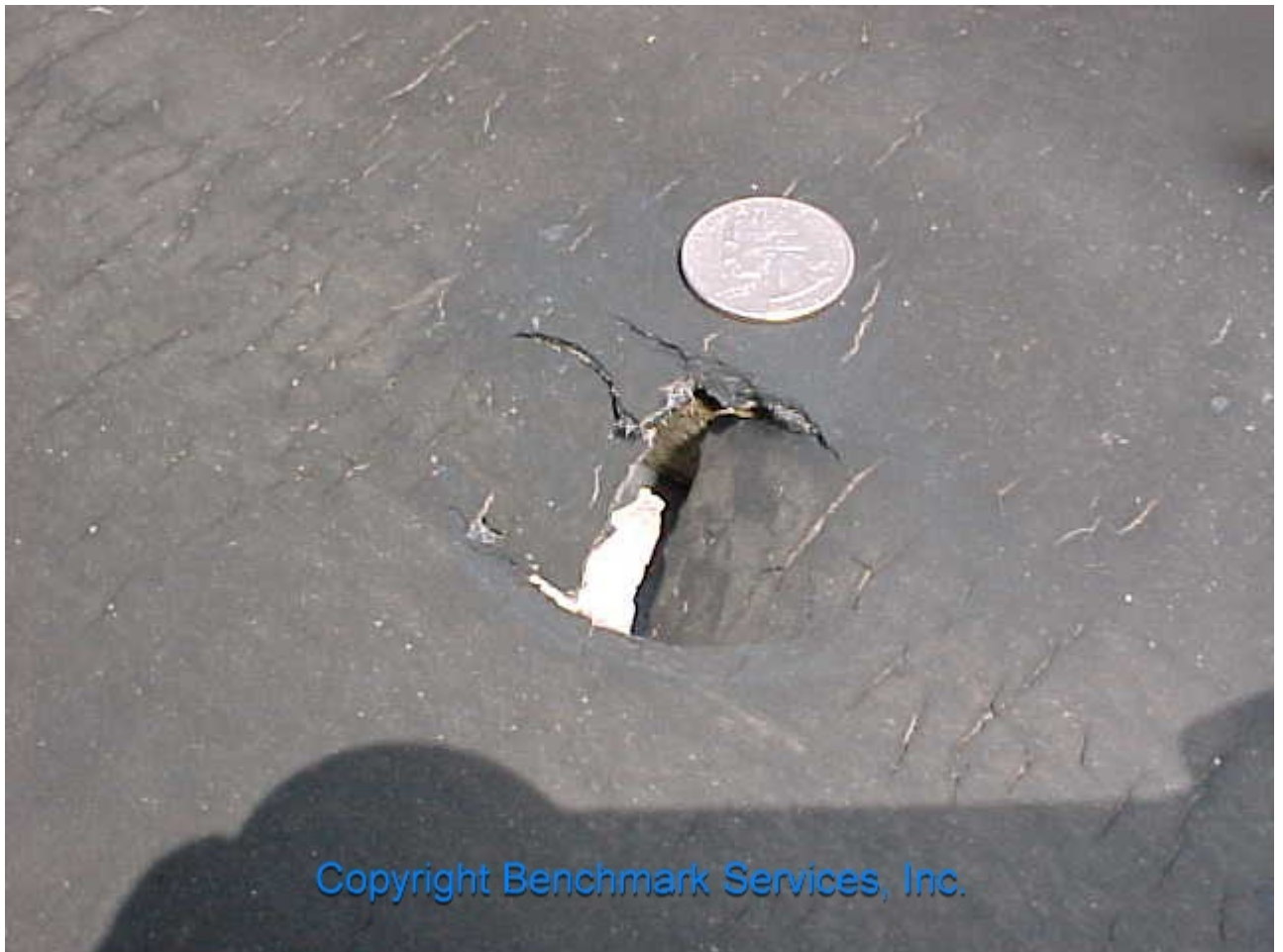
Figure 4 - APP Modified Bitumen Punctured By Hail

Because of this, the membrane is protected by a granule surface. This granule surfacing may be displaced by hail impact and even though the membrane is not fractured, it would require replacement due to the granule displacement. Both APP and SBS membrane systems can be damaged by hail impact since they are still asphaltic products. The photos in figures 4 and 5 show an unsupported area on a smooth surfaced APP membrane and an SBS granule surfaced membrane. Both were damaged by approximately 1 ½ inch diameter hail.