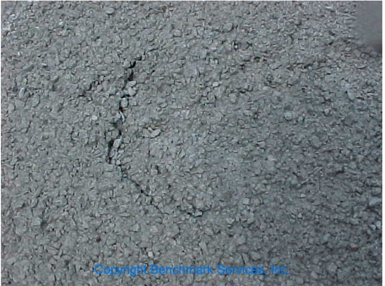
Figure 3 - Hail Damaged granule surfaced SPUF Roof