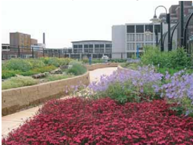
Schwab Rehabilitation Hospital - Chicago, IL (2005 Green Roof Awards of Excellence winner)

A "successful" green roof is one that stays watertight and looks great over time - not for just the first or second year, but for decades. American Hydrotech's Garden Roof® Assembly is based on more than 35 years of proven green roof technology and experience. Because it's designed from the substrate up as a "complete assembly", it's much more than just the sum of its parts.